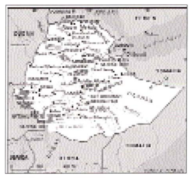
Fig. 1 - Map of the study area

as a discrete factor, agricultural development.